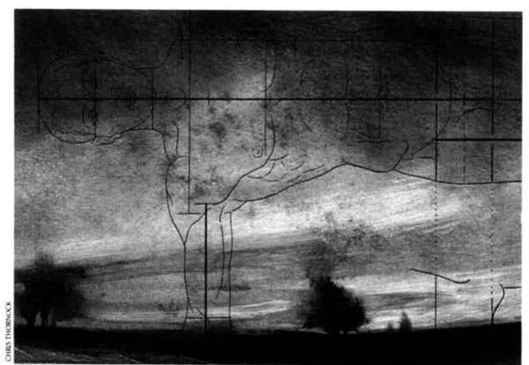
The land is a necessary part of our covenant-making with the Lord, and we cannot pollute the land without polluting our souls and inviting natural forces to sweep us off the face of the land.

God has told us what kind of fast he requires of us and what blessings will follow a righteous fast and a new covenant of peace in the land and with the land. The desert will blossom, we shall be able to rebuild the waste places, to repair the wounds we have made in the land, between peoples, in our own souls, to become the restorers of proper paths to dwell in. Listen to the word of the Lord to Isaiah: