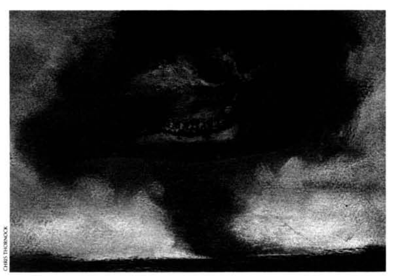
God covenanted with ancient Israel that the desert would bloom, but in this place, at the Nevada test site, the desert has not blossomed with roses, but with mushrooms—huge blooms of death, germinated in dark caves underground.

There before them, carpeting the depression, were thousands of fairy bells with lavender hearts, tossing their lovely heads. Flowers wilting at a touch, so delicate as to be almost otherearthly there among