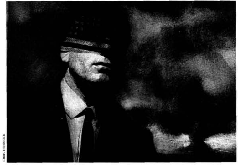
Unquestioning Mormon superpatriotism has been perhaps the most dangerous result of our accommodation to American values. It has led many Mormons to acquiesce to nuclear testing and even to accept the government's cruel refusal of responsibility when the truth came out.

ternational press sources that began to counter the belief I had in American righteousness, in America's right to power to have its own way in small nations far away. Then, in 1964, quite suddenly I experienced a dramatic paradigm shift, a sea-change in my inner being. The infamous